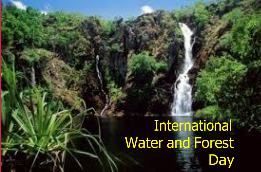
International Water and Forest Day