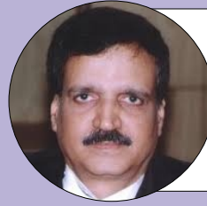
Hon'ble Justice G. V. Seethapathy Former Judge, High Court of Andhra Pradesh

Subject: Bharatiya Nagarik Suraksha Sanhita, 2023