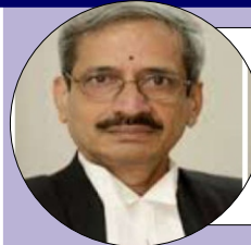
Hon'ble Justice Sitharam Murthy Former Judge, High Court of Judicature at Telangana