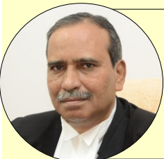
Hon'ble Justice Shri M. S. K. Jaiswal Former Judge, High Court of the State of Telangana