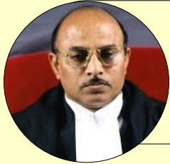
Hon'ble Justice Sheeshashayan Reddy

Former Judge of the High Court of Andhra Pradesh