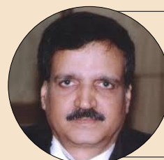
Hon'ble Sri Justice G.V.Seethapathy Former Judge, High Court of Telangana