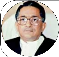
Hon'ble Justice B. Prakash Rao Former Judge, High Court of Andhra Pradesh.